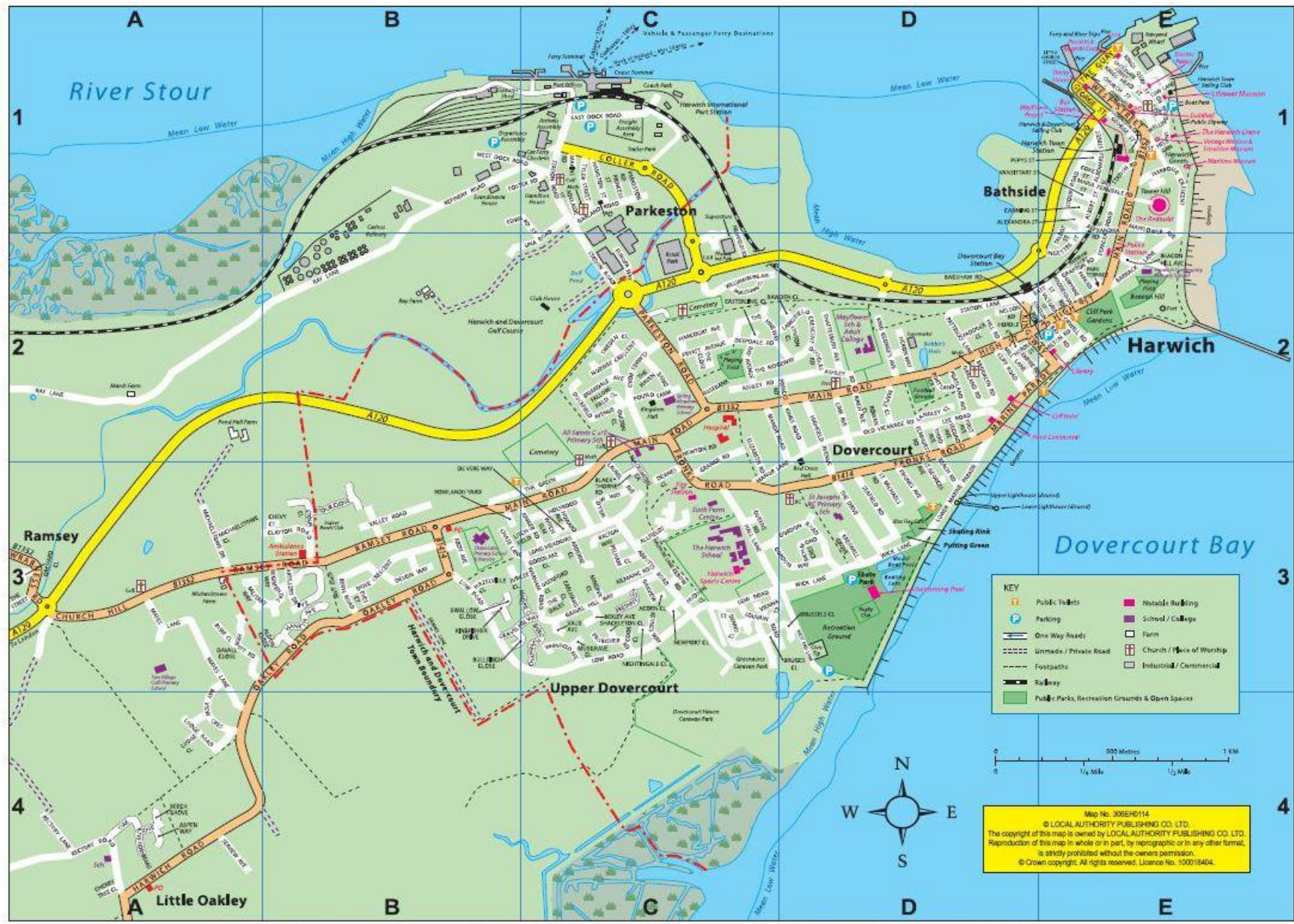
Although our mapping data is sourced from Ordnance Survey's latest data sets, current accuracy cannot be guaranteed at time of press. Should you notice an inaccuracy or omission, please email harwich@localauthoritypublishing.co.uk so that next edition's map is as up to date as possible.